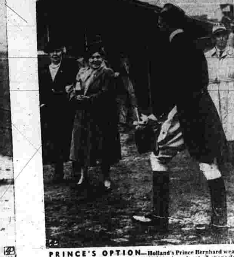
PRINCE'S OPTION—Holland's Prince Bernhard wears old costume of infantry sergeant and out-fitted in place of silk topper in hand, at Rotterdam Horse Show.